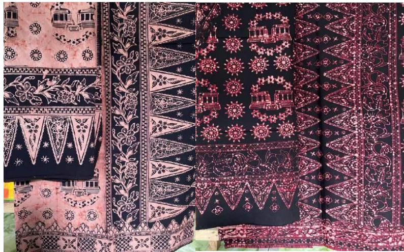
Figure 1. Partner Product Samples

The science and technology model delivered to partners includes a social media strategy in contrast to SCRM. Organizations can measure marketing and communication campaigns using social CRM, generating statistics on likes and dislikes. Choosing SCRM is undoubtedly a long-term commitment. SCRM is a different approach that monitors social networks to get an ever-increasing level of client interaction and also identifies in a more efficient way the opportunities/prospects that come through these channels. Social CRM is a CRM that integrates Social Media accounts of an organization and automates interactions with fans, followers, clients, likes, etc. In a structured way, the company knows what its market thinks of their products and services, can plan or schedule responses, can forward information to the right people, etc.