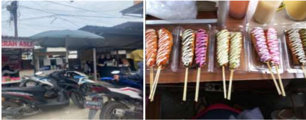
Figure 1. The condition of Rivan Corndog's premises.

and shopeefood to disseminate his products among the public and people who are lazy to leave the house also easily order them through digital marketing that has been provided by the owner of this Rivan Corn dog. The problem faced by this snack place is only the inadequate parking lot because the place is united with the Alfamart environment so it makes it difficult for customers to find a parking lot because they are confused by the number of motorbikes that are very large and messy and also the place that sells it is difficult to reach because it is adjacent to other sellers. (Marlina et al., 2023).