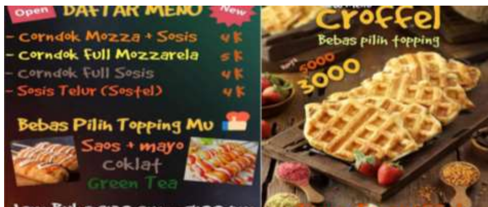
Figure 2. Rivan Corn Dog menus and new menus

After marketing from all kinds of social media and the products made are known to many customers, the products we produce will also increase and the quality of the products we make must be improved so that customer satisfaction increases. And the products offered are also not too expensive and suitable for student pockets, finally making opportunities much greater and also the price in digital marketing is not too far from the place directly so many also buy via shopeefood and gojek. Here are some of the menus available at Rivan Corndog (Paramithaet al., 2021)