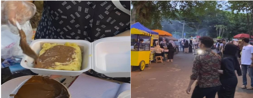
Figure 2. Various Flavor Toppings

Shape is the most important factor to attract consumers shaping a product can be done by hand and using molds. Auliya & Aprilia (2017), "The shape of food plays an important role in eye appeal (Cahyani & Hertati, 2023). An attractive food shape can be obtained by cutting various ingredients." The neat shape of the semi-circular pancong cake uses a pancong cake mold with a special mold, the technique of pouring pancong cake batter into the mold using a spoon measure and being careful when pouring the batter. Here's a photo of the sales activities of Kue Pancong Kekinian: