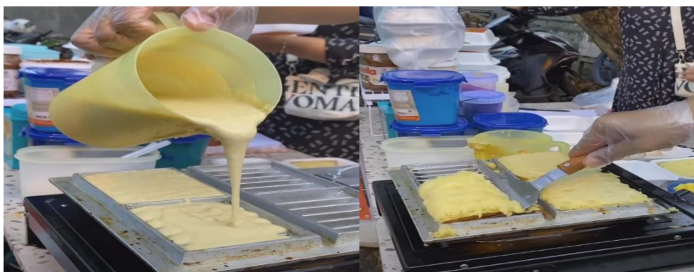
Figure 1. Pancong Cake Making

Through this series of stages, students are expected to develop innovative skills, market understanding, and business capabilities that can be applied in the development of contemporary flour processed products such as pancong cakes (Awalia, 2022).