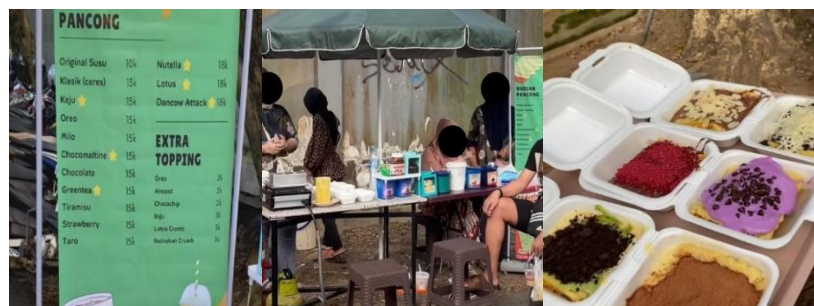
Figure 5. Cake Buyers and Types of Cakes

A total of 56.5% of the participants stated that the pancake bakery containing action training materials at UIGM Students was very attractive to participants. A total of 34.8% of participants stated that the training taught was very good and accepted by the trainees, and 8.7% of students stated that the training used was very good (Lesi Hertati & Puspitawati, 2023b). The methods used in lecturer education in university action research writing training are appropriate to fulfill lecturers' educational responsibilities. This community service activity correlates with previous research findings (Paramita et al., 2021).